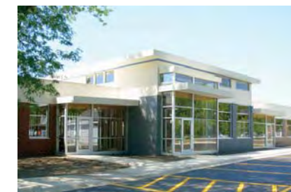
4th & 4th Professional Building