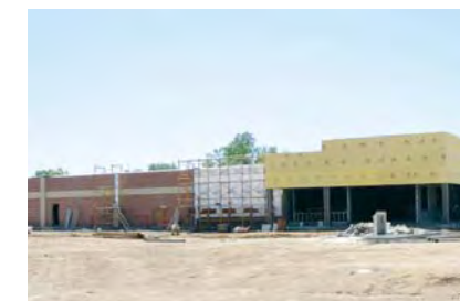
ALDI Grocery Store