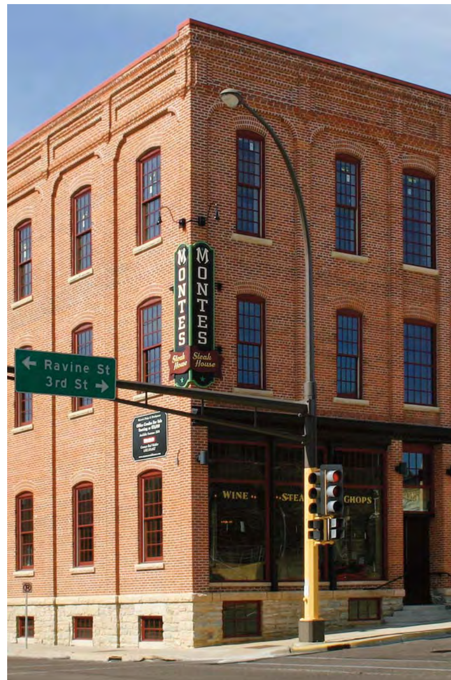
Monte's Steak House