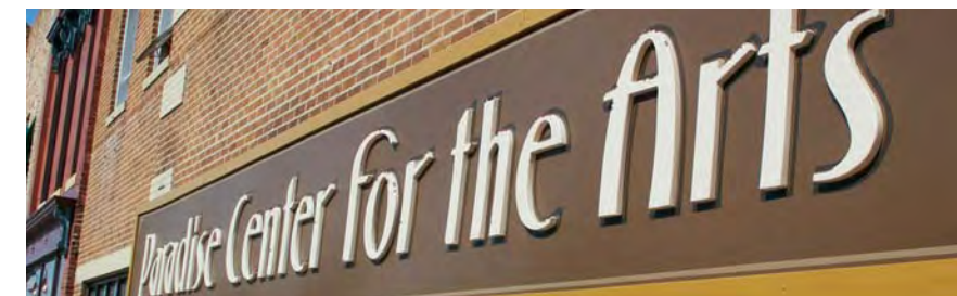
Paradise Center for the Arts