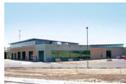
City of Faribault Public Works Facility